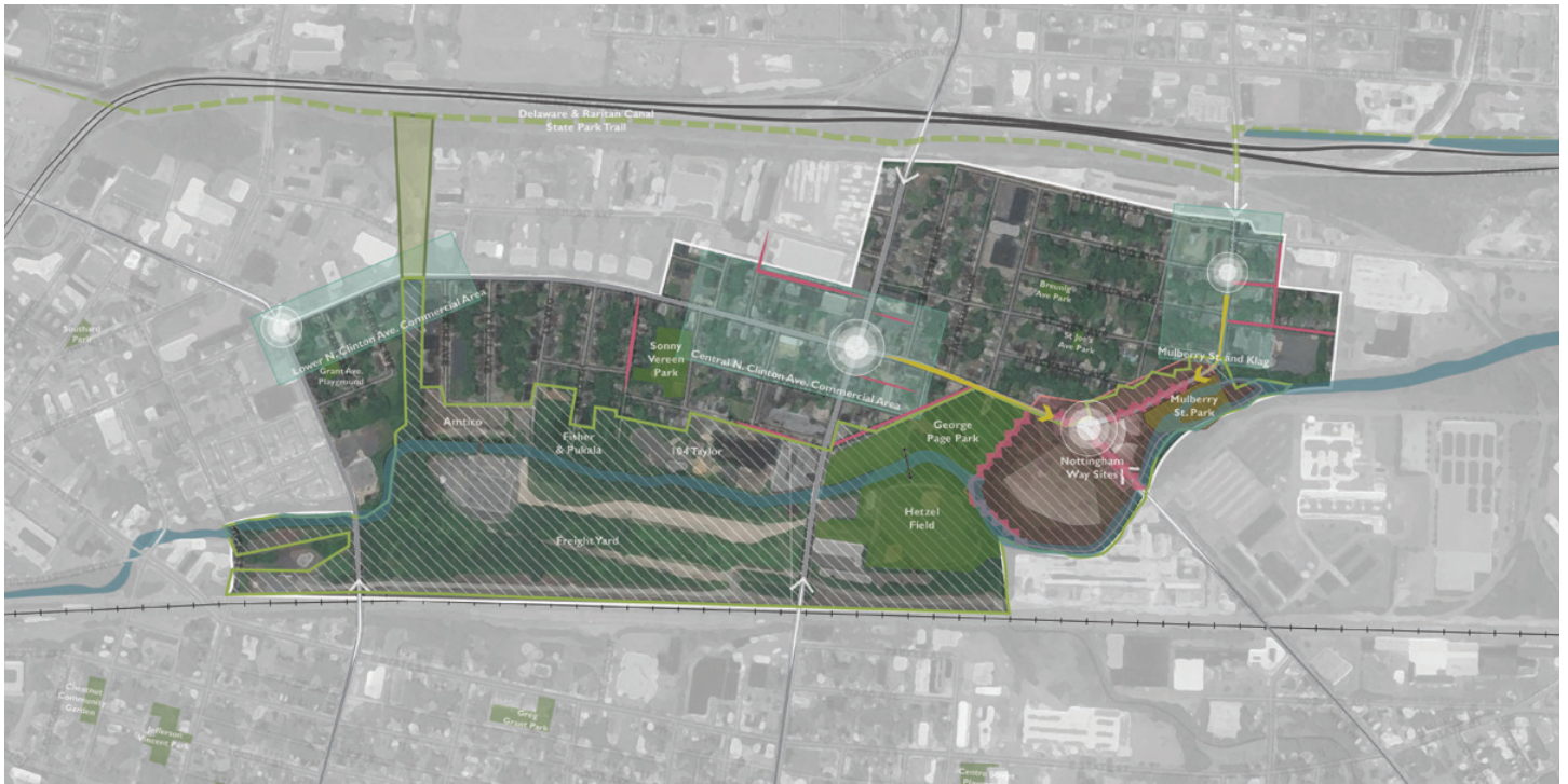
Synthesis map of the East Trenton Neighborhood & its vicinity.