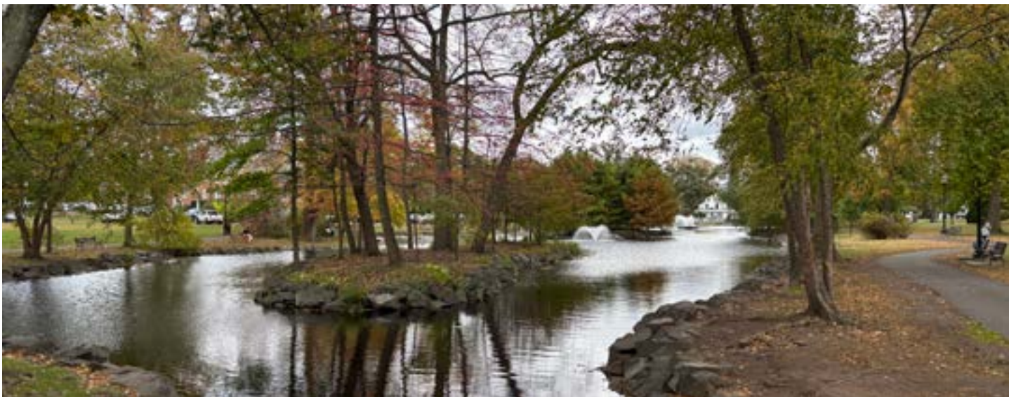
Mindowaskin Park, Westfield