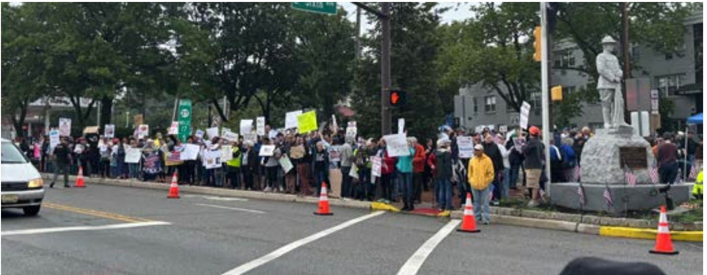
No Kings demonstration in Highland Park