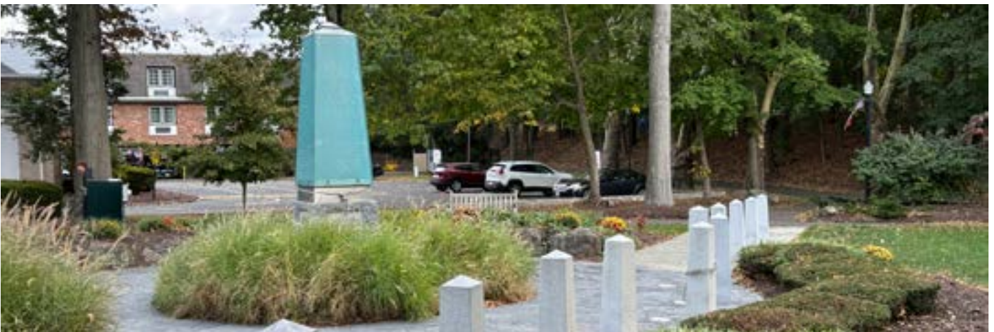
9/11 Memorial, Westfield