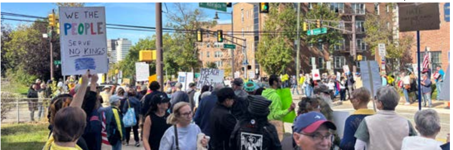
The other point of view.