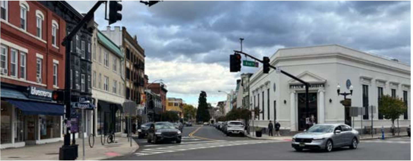
Westfield has an attractive and vibrant downtown.