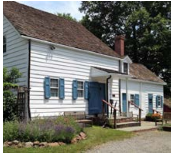
Colonial period Miller-Cory House Museum

the Washington-Rochambeau Revolutionary Route National Historic Trail. The 700 miles of land and water routes were followed by the allied Continental and French armies between 1780-83, passing through Massachusetts, Rhode Island, Connecticut, New York, New Jersey, Pennsylvania, Delaware, Maryland, Virginia and what is now Washington D.C. This march led to the American-French victory over British forces under Lord Cornwallis at the siege of Yorktown, Virginia, and essentially ended the War for Independence. The National Historic Trail also includes the allied troops' return march and water routes and related reconnaissance expeditions of the officers. Today, the Westfield section of that historic path became Mountain Avenue, South Avenue West, and Broad St. Our client is the Washington-Rochambeau Revolutionary Route New Jersey (W3R-NJ), a non-profit organization that