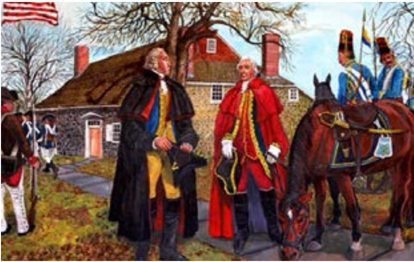
Comte de Rochambeau and George Washington