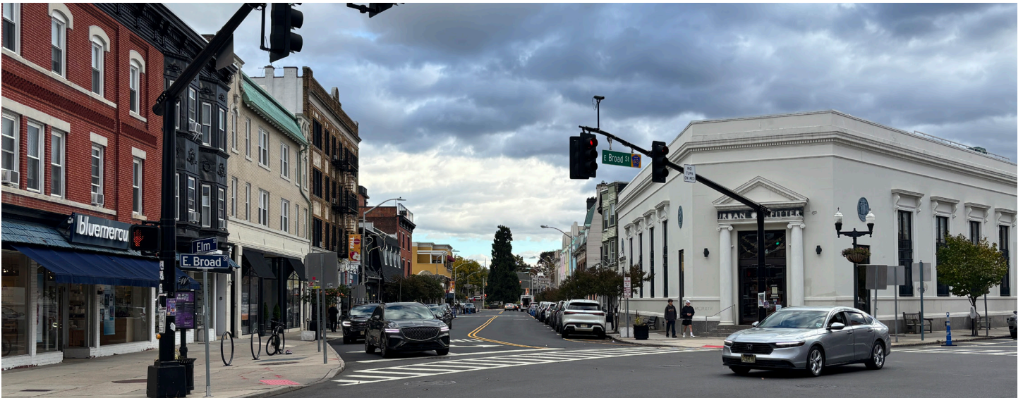
Westfield has an attractive and vibrant downtown.