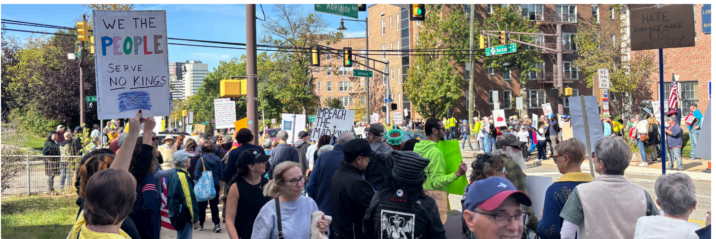
The second demonstration October 2025