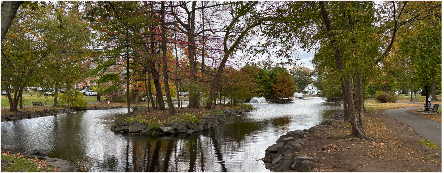
Mindowaskin Park, Westfield