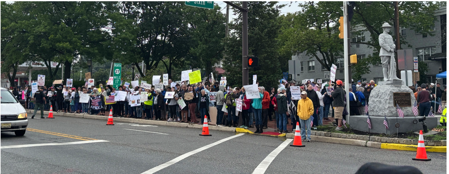
No Kings demonstration in Highland Park