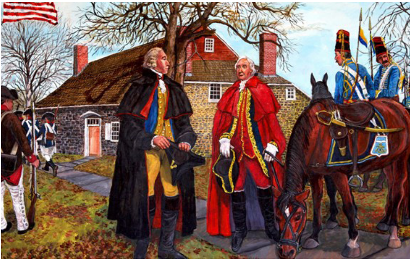
Comte de Rochambeau and George Washington