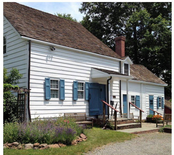
Colonial period Miller-Cory House Museum

the Washington-Rochambeau Revolutionary Route National Historic Trail. The 700 miles of land and water routes were followed by the allied Continental and French armies between 1780-83, passing through Massachusetts, Rhode Island, Connecticut, New York, New Jersey, Pennsylvania, Delaware, Maryland, Virginia and what is now Washington D.C. This march led to the American-French victory over British forces under Lord Cornwallis at the siege of Yorktown, Virginia, and essentially ended the War for Independence. The National Historic Trail also includes the allied troops' return march and water routes and related reconnaissance expeditions of the officers. Today, the Westfield section of that historic path became Mountain Avenue, South Avenue West, and Broad St. Our client is the Washington-Rochambeau Revolutionary Route New Jersey (W3R-NJ), a non-profit organization that